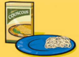
Cooked pasta or couscous 125 mL (½ cup)