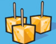
Cheese 50 g (1 ½ oz.)