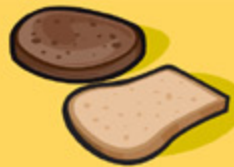
Bread 1 slice (35g)